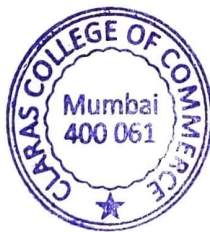
Principal Claras College of Commerce Yari Road, Versova, Andheri (W), Mumbai-400 061