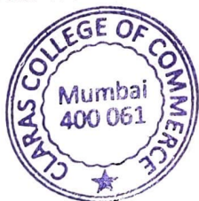
Principal Claras College of Commerce Yari Road, Versova, Andheri (W), Mumbai-400 061